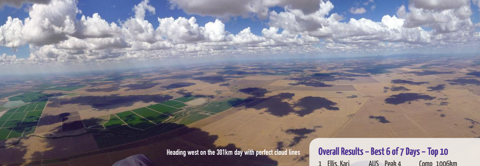
Heading west on the 301km day with perfect cloud lines

For those already on their way north, cloudbase went over 4000m with strong climbs and a good tailwind. Some blue holes slowed the speeds down in some sections.