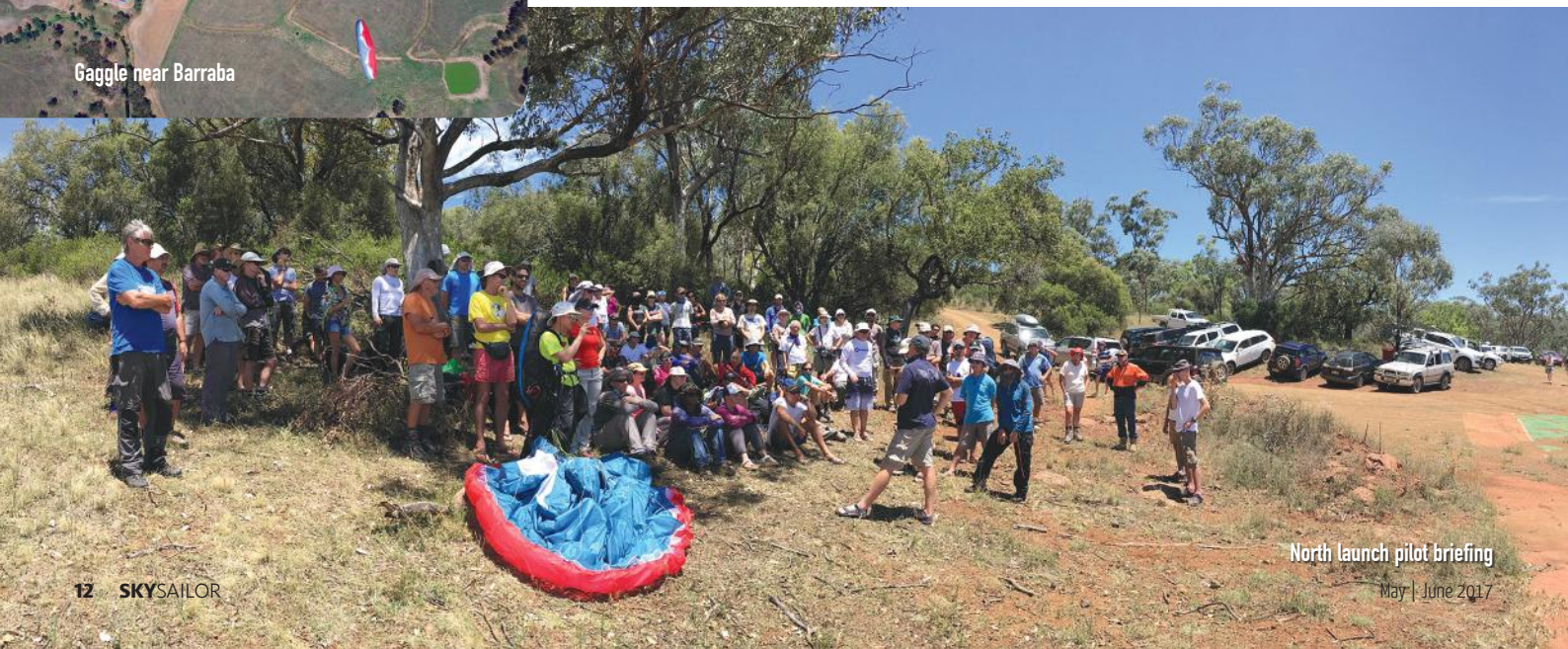
North launch pilot briefing

By 11:30am, Borah west launch had stronger cycles coming through which kept many pilots waiting for a lull. Unfortunately, just as the day started, a Japanese pilot in one of the first gaggles lost control of his Sport Class glider and, after 200m of height loss trying to unsuccessfully recover it, failed to throw his reserve in time and hit the hill below the south launch. The rescue helicopter was called in and resulted in launching being suspended for over two hours. The pilot was flown to Newcastle in a stable condition with a broken pelvis and other injuries.