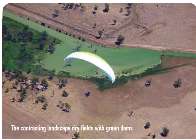
The contrasting landscape dry fields with green dams