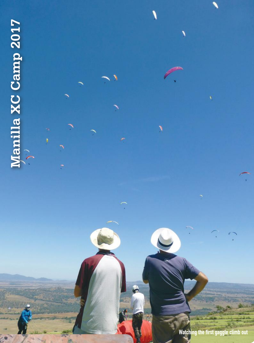
Watching the first gaggle climb out