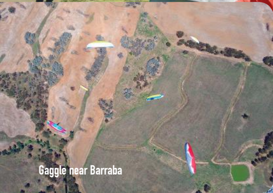
Gaggle near Barraba

stronger thermals that broke through the lower level and climbed to 2100 to 2500m, allowing for a faster average speeds with better tailwind up there as well.